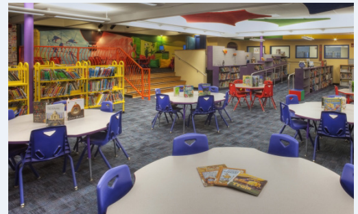
Elementary library media center inspiration